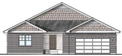
ALTERNATE ELEVATION 'B'