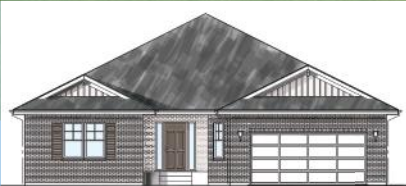
ALTERNATE ELEVATION 'A'