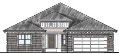
ALTERNATE ELEVATION 'D'