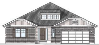
ALTERNATE ELEVATION 'C'